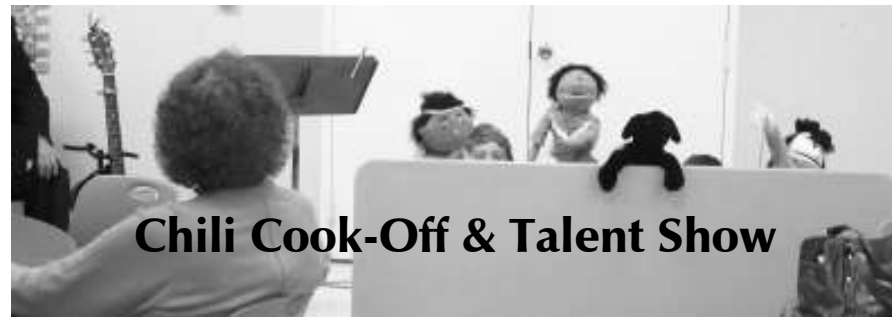
Chili Cook-Off & Talent Show