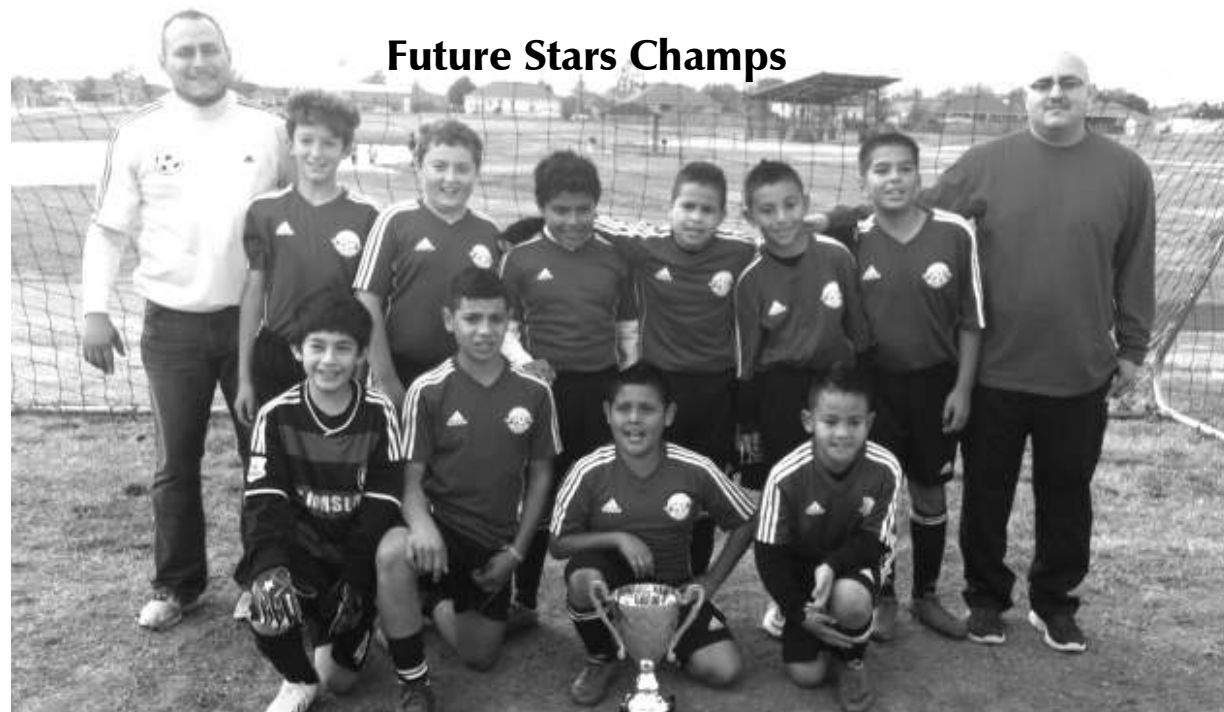
The Future Stars Fury soccer team won their tournament last week. They were undefeated! Congratulations on a great season. RHBC is pleased to have a part in this ministry to our community's youth. See anyone you know?